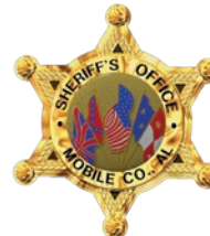
Mobile County Sheriff/Deputy