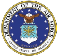
United States Air Force