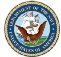
United States Navy