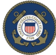
United States Coast Guard